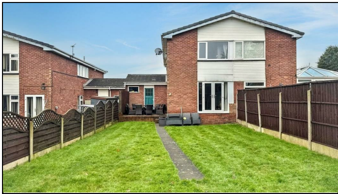
Stephens Road, Sutton Coldfield, B76 2TS